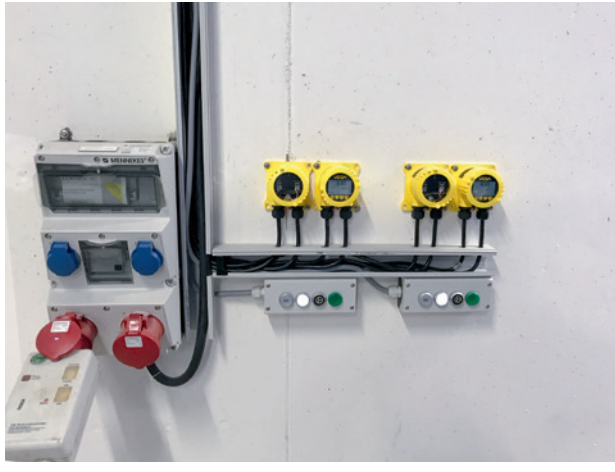
The measured values from VEGA sensors are important command variables that guarantee reliable operation of the system, and thus a dependable drinking water supply around the clock.

A whole array of safety measures were implemented on the new drinking water pipeline. For example, drop weight flaps were installed to prevent damage in case of a pipe break. And to ensure that a power failure would not have any devastating consequences, several pressure chambers were installed at the Primstal dam as well as in the waterworks. These vessels are filled half with water and half with compressed air. If a damage event occurs, the compressed air layer acts as a damper by absorbing the enormous energy of the water column. This prevents mechanical damage to the pumping station and the surrounding components. This is where VEGAPULS 64 comes into play, monitoring every one of these pressure vessels. This high-precision radar level transmitter measures the exact level in the pressure vessel contactlessly and reports it to the controller. At the same time, VEGABAR 82 pressure transmitters check the pressure in the vessel and along the entire pipeline and report it too. The correct level is immensely