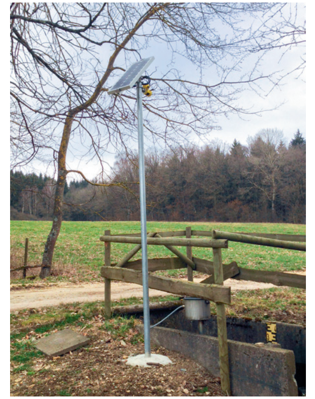
Since no power connection is available at this location, the measured values are recorded every hour by a PLICSMOBILE T81 with accumulator and solar panel and forwarded to VEGA Inventory System.

to specify how often we needed the data, what data had to be sent, and what measurement unit the data had to be in. When that was done, our work with that particular task was finished," adds Merscher in conclusion.