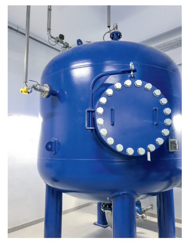
The high-precision radar level transmitter VEGAPULS 64 measures the level in the pressure vessel contactlessly and reports it to the control system.

All data are displayed in the respective control cabinets by the external, digital indicating and adjustment unit VEGADIS 82. If the location of the sensor makes it necessary, the measurement data can also be displayed remotely via the display and adjustment module PLICSCOM. "We also tried displaying measurement data at the Primstal dam via Bluetooth. It works perfectly and makes maintenance a lot easier," points out Merscher. He especially appreciates the simple adjustment and operation of VEGA sensors: "They are intuitive to use, and thanks to the plain text display, you know exactly what to do - setup and adjustment is so easy!"