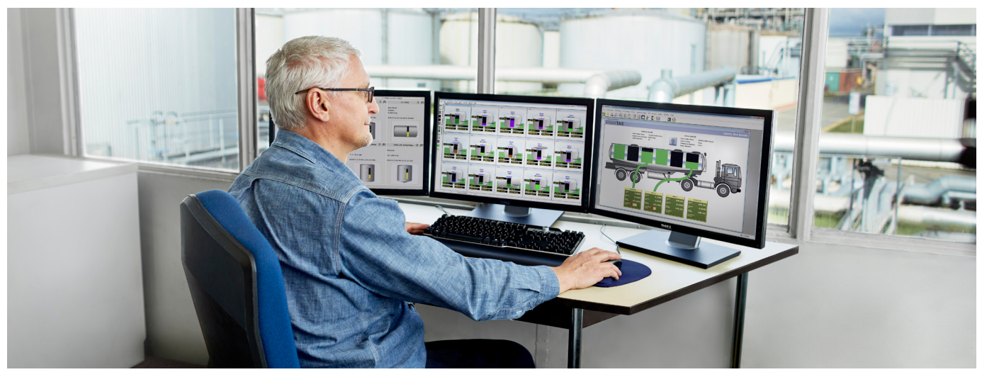
Figure 3: Tank monitoring HMI software, such as Endress+Hauser's Tank Vision, displays the output of each tank in a tank farm and checks for indications of leaks or overfilling.

Instrument 6 PC-based Monitoring Software (Figure 3). This is a typical PC-based HMI software package that displays the output of each tank in a tank farm as well as volume calculations. Such software packages are available from several suppliers. These software packages typically have web server capability built-in, so an operator or engineer can quickly and easily access tank information from any PC or handheld device via a browser.