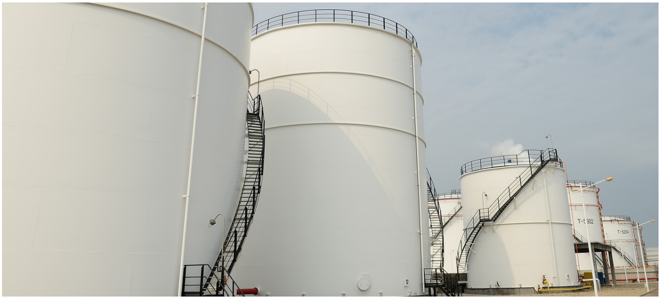
Figure 1: Storage tanks containing dangerous chemicals require multiple levels of instrumentation, controllers and software that can monitor the contents of a vessel and provide an alarm in the event of a leak or overfill event.