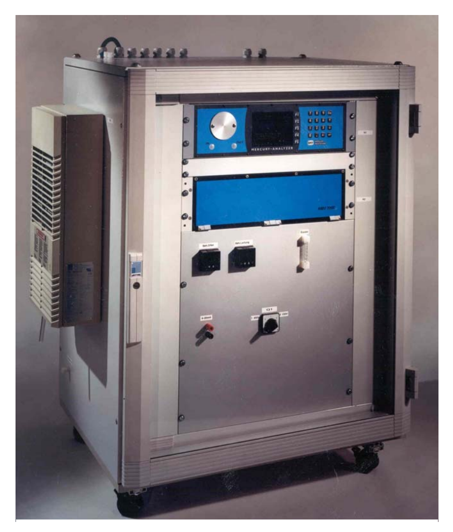
Figure 2 : Continuous emission monitor HgCEM

reduced. The amalgamation unit consists of an integrated valve assembly, a gold trap and a calibration source for elemental mercury vapour. The valve assembly can be switched to a "continuous mode operation" in case of high mercury concentrations. By modifying the collection time associated with the Gold amalgamation unit it is possible to lower the detection threshold of the system. The UV photometer used for measuring the gas-phase concentration of elemental mercury consists of a fixed wavelength atomic absorption spectrometer at 253.7 nm wavelength. The photometer has a reference beam for lamp control and an electrodeless low-pressure lamp with long service life (>20000 hours). The entire system is functionally controlled by a microprocessor. All input is made through a water-resistant front panel keyboard with user-programmable keys ("soft keys"). A large TFT colour screen displays all system variables and measured values. The system components are used in a "swing design" compartment and can be very easily accessed. The most important components are housed in two 19" rack-mounted units each 3 units high.