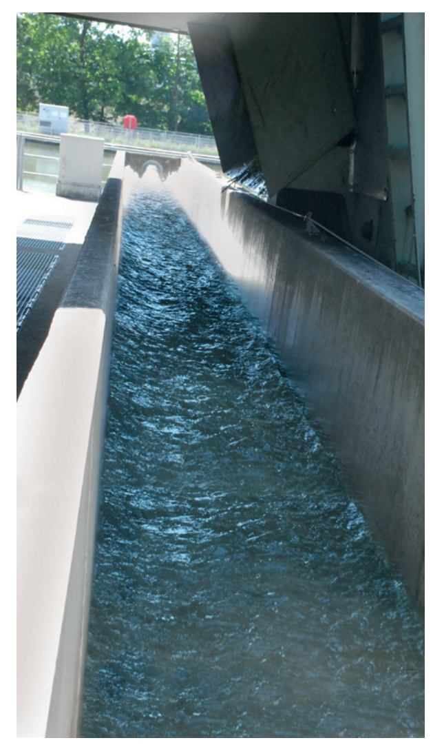
Like a big waste filter: the water that gets caught on the screen is returned to the Danube via a special channel.

By 2030, Germany wants to supply almost half of its total electricity requirements from renewable energy sources. Hydropower will play an important role in this. According to the Federal Ministry of Economics and Energy, its potential in Germany is largely exhausted. However, since hydropower flows continuously day and night and can be regulated at a moment's notice, existing facilities are being modernized as much as possible and made more efficient. Without any support at all from the 'Renewable Energy Sources Act' in Germany, hydropower technology, with its high economic efficiency performs amazingly well in the face of unequal competition and helps reduce the load on the grid infrastructure by providing constant output.