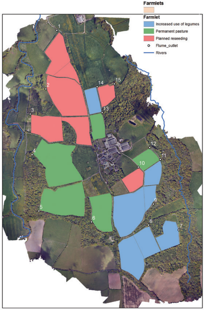
Figure 2: The North Wyke Farm Platform project 'farmlets' (red, blue and green) and 15 sub catchments with topography mapped.

One thing is for sure, with the continuing pressures of land use and climate change on our waterbodies, monitoring using well established and new techniques will definitely be needed going forward. There is a continuing need to manage our catchments, and meet the requirements of the Water Framework Directive to improve the water quality for both ecology and for the benefit of humans.