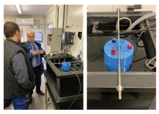
Figure 2. The DropletSens™ Monitor for Nitrate and Nitrite deployed in the outflow reservoir at the water treatment plant.

The DropletSens<sup>™</sup> Monitor for Nitrate and Nitrite was deployed in the outflow of a main water treatment plant in Germany in an outbuilding comprising in-line instruments to measure outflow total carbon, total phosphate and ammonia. The DropletSens<sup>™</sup> probe was placed in a reservoir which continuously received outflow water entering at the bottom and overflowing at the top as shown in Figure 2.