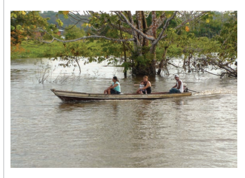
Figure 4: With practically no roads around, boats and other floating platforms are often the only means of transportation in this part of the world. A favorite of the local population, a miniscule outboard motor built from a gas-powered water pump—locally known as a "rabeta"—propels this family along the banks of the flooded Solimões river.

"Discharges are very important to us," Gamaro says. "We have to know accurate inflow to the dam. We do not have big capacity to store water – what goes in comes out, and we have very severe restrictions downstream." Discharge data – the volume of water flowing past a fixed point in a river over a given time – helps Gamaro and his team set daily energy production forecasts and determine how to operate the plant to produce electricity while keeping water flowing in a manner that is safe for residents downstream. Where hydroelectric dams supply most of the nations' energy needs, that's no routine task.