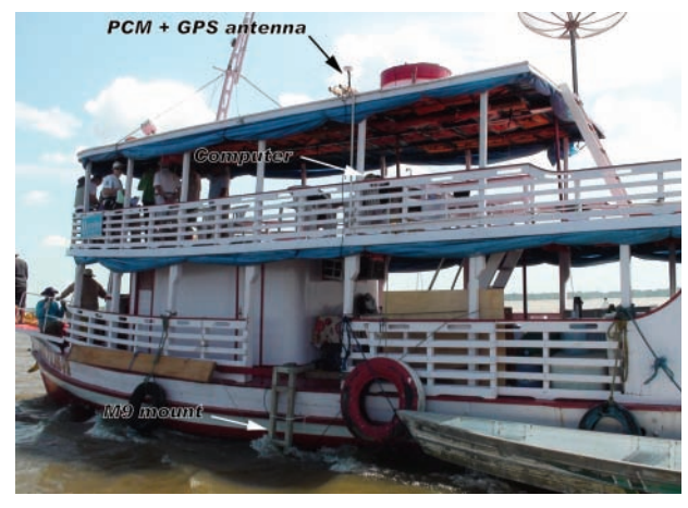
Figure 2: Boat used during the 2009 Amazon campaign. The Power and Communications Module (PCM) was secured to the roof of the vessel, along with the GPS antenna. The M9 system is in the water, about 1 m below the water line and attached to the boat with a custom-made mount. The computer on second deck received the processed data from the PCM via a Bluetooth radio link.