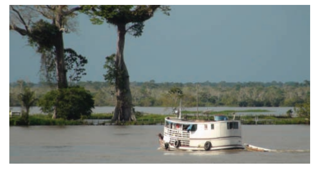
Figure 1: A workboat during a discharge measurement in the Amazon River.

The Amazon River is a system so massive it nearly defies description. Draining a watershed bigger than Western Europe, the Amazon carries 52.2 million gallons per second to the Atlantic. That's 209,000 cubic meters per second. It's 7.38 million cfs. Nearly 16 times the average discharge of the Mississippi River. Enough to fill Lake Erie in less than a month. More fresh water flow than anywhere on earth. To a hydrologist, every aspect of measuring the Amazon is a challenge of the highest magnitude.