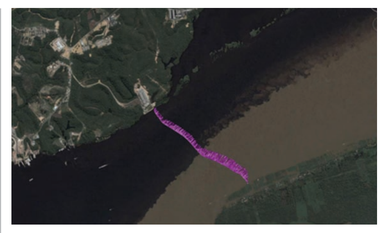
Figure 9: Ship track for Meeting of the Waters transect, overlaid on Google Earth satellite photo. Start of transect was on northwest margin and river was flowing from left to right on image, as indicated by the purple velocity vectors. Total discharge at this site was 168,581 m<sup>3</sup>/s (5.95 million ft<sup>3</sup>/s).

In the Solimões, the M9 delivered outstanding velocity readings to depths of 50 meters and more, Velasco reports. "We knew we would be pushing the limits of the M9's specified 30-meter maximum velocity profiling range," he says. "Now, our problem is that we'll need to update our brochures, because we're sure getting more than 30 meters!"