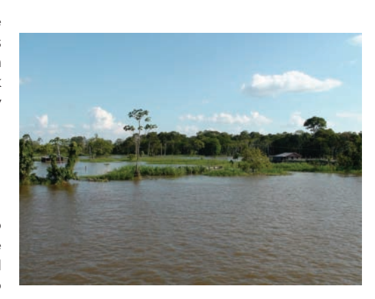
Figure 7: A theodolite operator welcomes the crew bringing his lunch. With transects lasting up to 12 hours and no replacement crew, theodolite operators often spend several hours every day at stations like this, calling out angles and time-stamps via radio to the boat performing the actual velocity measurements. Under normal conditions, these stations are on dry land, but due to the 2009 floods, several of

them had to be raised—like this one—or moved to