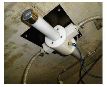
Figure 1: spectro::lyser™ in bypass installation.

Whether your objective is to protect drinking water quality, perform environmental monitoring or to oversee of wastewater treatment processes, in-situ & online UV/Vis spectrometry can provide the solution. Online spectrometry, in the form of s::can spectrometer probes, has found its way into these and many other water monitoring and management applications. There are numerous approved standardised applications available and the range is continuously expanding due to the development of new spectral parameters. Additional sensors - e.g. for monitoring NH_4^+ , DO, pH or EC – can be easily integrated into s::can monitoring systems to increase the range of applications even further. The Water Quality Monitoring Station, which is introduced here, provides a standardised and fully modular infrastructure that facilitates the operation of s::can sensors from a single simple and compact platform.