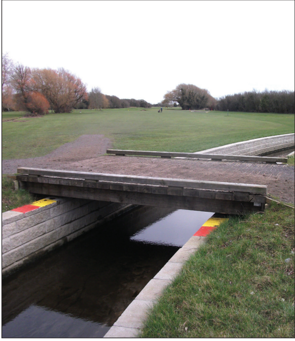
New channel increases hydraulic capacity.