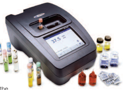
Spectrophotometer with tube reagents

Wastewater monitoring can deliver substantial savings for a number of reasons: it can ensure that a process complies with its discharge consent; it can ensure that treatment charges are accurate; it enables rapid response to pollution incidents; it identifies abnormal concentrations and peaks and provides an accurate picture of the process so that efficiency opportunities can be identified, such as reduced waste and recycling.