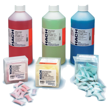
Fig. 7: Colour-coded pH buffer solutions for routine applications

When large numbers of samples have to be handled, and for quality control purposes, it is advisable to measure a control standard between calibrations. HQD has a "Check Standard" function for this purpose. This is defined by the user, who is then automatically prompted to measure a standard solution. If the result is not within the permissible limits of the standard, an error message is displayed and a new calibration is recommended.