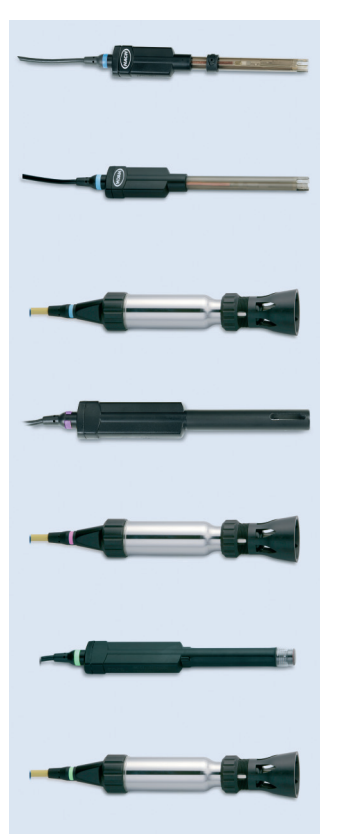
Fig. 2: A selection of electrodes from the extensive INTELLICAL range for pH, conductivity, oxygen and ISE, for laboratory and outdoor applications.

The HQD series provides reliable results with maximum efficiency. Unnecessary calibrations are avoided thanks to the INTELLICAL