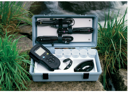
Fig. 4: Complete HQD field kit

via LIMS. To ensure operational security and prevent accidental changes to settings, HQD has an optional password protection feature.