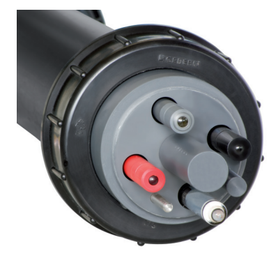
The ISEmax sensor consists of ion-selective electrodes and a reference electrode which are installed in an immersion assembly with automatic compressed-air cleaning and a pre-amplifier

stored. These ionophors facilitate the selective "mi-gration" of the ions to the inside of the electrode and this change in charge causes an electrochemical potential - which is in proportion to the ion concentration - to be built up via the membrane. The potential is transmitted to the metal lead of the electrode by means of the inner electrolyte and measured against a separate reference electrode with a constant potential. The difference in voltage is then converted to a substance-specific concentra-tion using the Nernst equation.