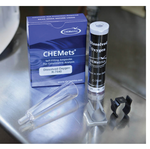
<sup>1</sup>CHEMetrics<sup>®</sup> Visual Test Kits: K-7511, K-7518, K-7540 and K-7599

CHEMetrics® Test Kits are commonly used as a primary means to measure DO in boiler systems. They are also used as a secondary means to verify online equipment readings or as a backup method when online equipment is out of service.