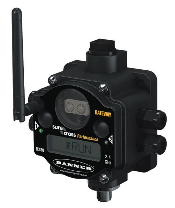
Banner Engineering - Wireless Radio Module

Having a precise control of tanks volumes allows operating companies to efficiently coordinate fuel purchases with respect to fuel market fluctuations. It also helps avoid losses and inaccuracies caused by human errors. The exact measure of volume is not dependent only on level; mass, temperature, and density variations have also to be taken into consideration. Installation costs for this type of application can be very high because of the tank's remote location, which can be several