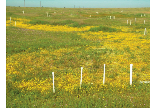
Vernal pool wetland near Sacramento, CA during spring season, with slotted PVC pipes containing water level dataloggers.

soil, and climate. This creates a unique habitat for diverse flora, amphibians and insects, including some threatened and endangered species.