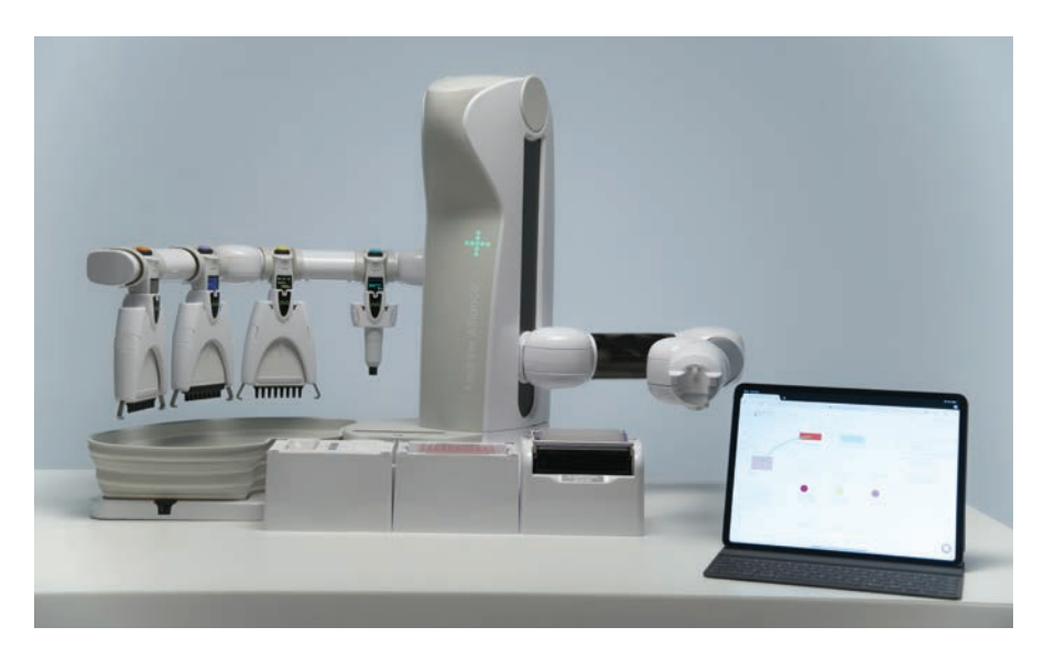
Figure 2. Andrew+ offers fully automated pipetting, as well as more complex manipulations, using a wide range of Domino Accessories and Andrew Alliance electronic pipettes. It executes OneLab protocols, enabling rapid transition from laborious manual procedures to error-free, robotic workflows.

Wireless execution of these protocols on its increasing range of connected devices, enabling fully automated liquid handling (Andrew+), guided pipetting (Pipette+), shaking (Shaker+)m rapid heating/cooling (Peltier+), magnetic bead separation (Magnet+), or micro-elution for SPE (Vacuum+) defines not only the blueprint for the connected lab of the future but also the capability necessary to realise the demanding sample prep requirements of multi-omics data integration, and therefore, pathway-based translational research.