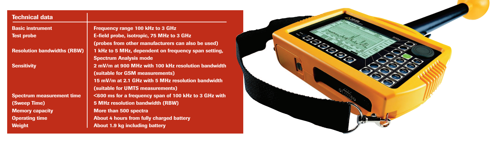
Fig. 7: The Selective Radiation Meter and E-field probe from Narda Safety Test Solutions.

Fig. 6: If you are familiar with spectrum analysis, you can use the instrument as a "normal" spectrum analyser and still benefit from the automatic functions. Here, for example, the spectral line in the GSM 1800 band is identified with the provider O2.