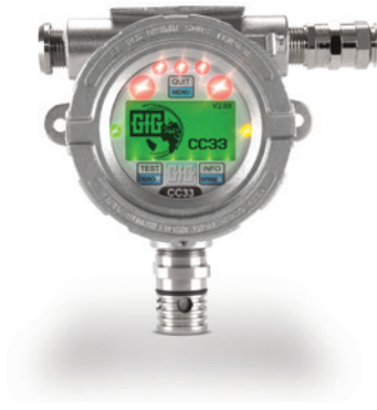
CC33 stainless steel

In a world in which economic success increasingly depends on data-driven process optimization and process automation, not being able to access all necessary information is no longer an option. But to rip and replace an existing and functioning infrastructure, just to achieve the necessary bandwidth for data transmission, makes