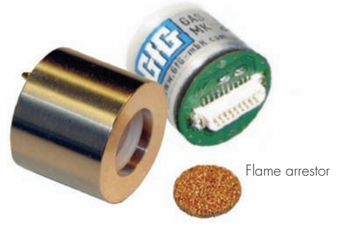
Figure 1: Combustible pellistor type sensor showing housing and detached flame arrestor

Understanding how combustible sensors detect gas is critical to correctly interpreting readings, and avoiding misuse of instruments that include this type of sensor.