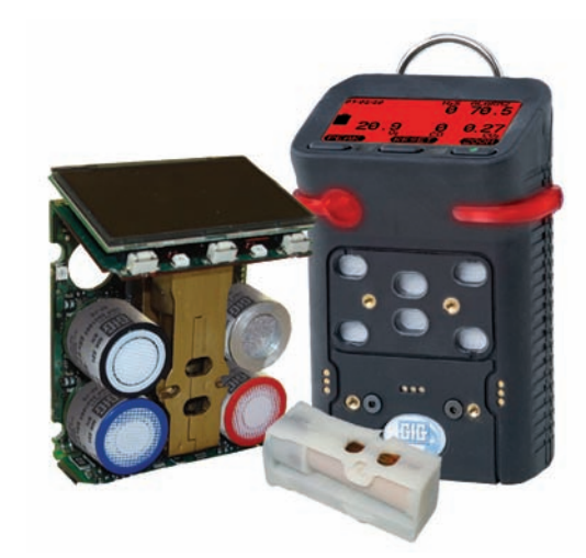
Figure 2: The G460 atmospheric monitor can support a wide variety of sensors including pellistor type LEL, PID and infrared combustible gases

This is one of the reasons that pellistor LEL sensors show such a low response when exposed to the vapors of "heavy" fuels such as diesel, kerosene, jet fuel and heating oil. Although most VOC vapours are combustible, the toxic exposure limits are much lower than the flammability limits. For example, for diesel fuel 10% LEL is equal to about 600 ppm vapour. However, the TLV (Threshold Limit Value) for diesel vapour is only 15 ppm (as an 8 hour TVVA). If you wait for the combustible gas alarm to go off at 10% LEL you could potentially exceed the toxic exposure limit by 40 times!