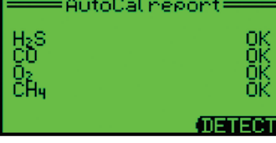
Figure 4: GfG instruments can be automatically fresh air zeroed or calibrated by means of a simple "AutoCal®" procedure, (press "Air" to make an automatic fresh air zero adjustment, "Gas" to make a span calibration adjustment, or "Exit" to return to normal operation)