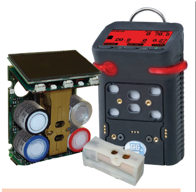
Figure 2: Changes in humidity as well as exposure to certain contaminants can affect the output of gas detecting sensors in fresh air.