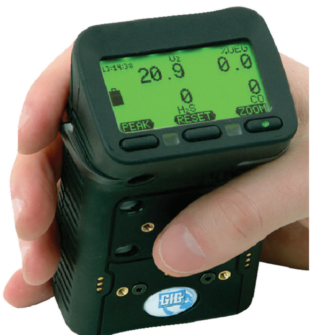
Figure 1: Always allow all of the sensors installed in your instrument to stabilise completely in fresh air BEFORE making a fresh air zero adjustment.

In some designs the dead-band can be quite substantial. For instance, some brands of instruments equipped with miniaturised pellistor type LEL sensors have a dead-band that stretches all the way from -3% to +3% LEL. In other words, in the presence of a rising concentration of gas, the first reading displayed is 4% LEL. At 3% LEL the instrument reading is still "locked" on zero. Similarly, until the output signal reaches a value of -4% LEL, the display shows a reading of zero.