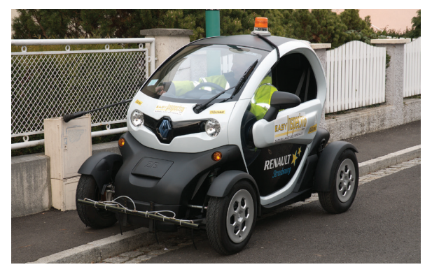
EASY INSPECTRA™ with single driver/operator.

The EASY INSPECTRA™ equipment that can be installed in small-size carriers revolutionizes the very concept of network survey by combining both pedestrian and vehicular detection.