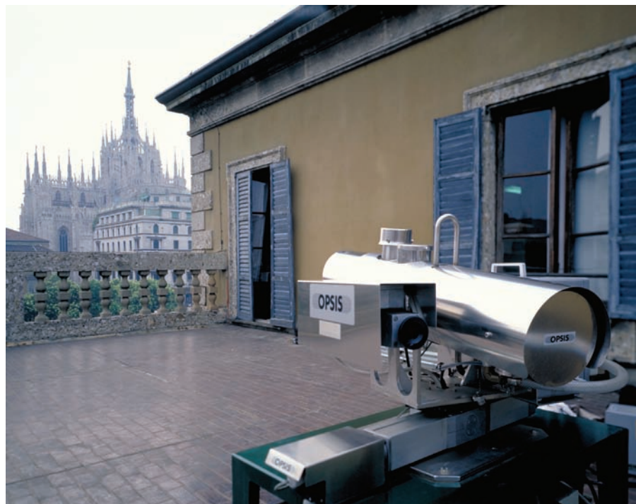
An OPSIS Open Path Monitoring station measures gasses across a light path from a roof top in Milan, Italy

We believe that today's customer is looking for a company that can offer long-