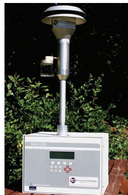
With a proven EU equivalency, the BAM1020 is a rugged, reliable system for the measurement of PM 10 , PM 2.5 and TSP.

Open Path Monitoring uses a transmitter and a receiver to measure compounds between 200 – 1000m distances, therefore giving customers a more representative air quality measurement. The system works using an optical light path to measure stated gases. OPSIS uses DOAS (Differential Optical Absorption Spectroscopy) to measure these gases. How? A Xenon lamp transmits visible light from the transmitter to the receiver and gasses such as NO 2 , SO 2 , O 3 , Benzene and Formaldehyde absorb into the UV part of the light spectrum and are measured from there. The fantastic thing about OPSIS is that a higher amount of multiple gasses (up to ten or more) can be measured using just one OPSIS Open Path Analyser. The OPSIS System 300 was in fact the first ambient AQ system to