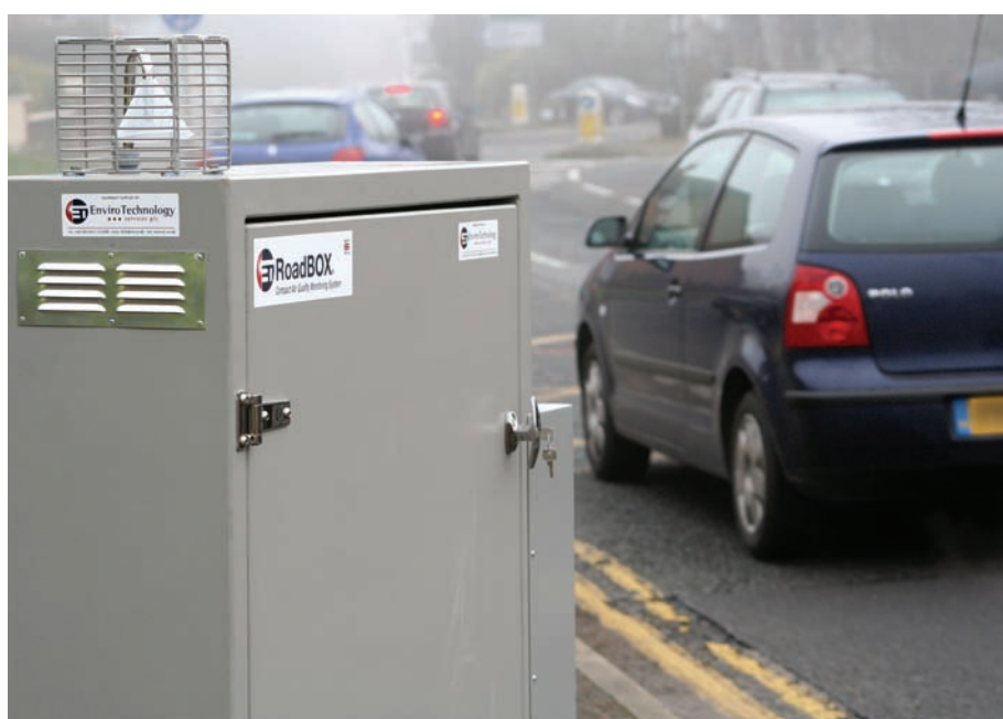
The new ET RoadBOX provides the perfect solution for roadside, kerbside and fenceline AQ monitoring