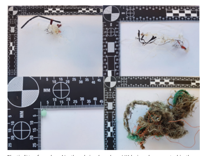
Plastic litter found on Northumbrian beaches, UK being documented in the forensic laboratory

Unlike in many microplastic pollution studies, forensic fibres analysis is not solely focussed on the use of Fourier Transform Infrared Spectroscopy (FTIR). Instead, it uses a series of observations to categorise and characterise the fibres. In forensic examinations 'layers of information' are sought to produce reliable inference of source. This is done in the knowledge that not all fibres of a particular polymer type are the same.