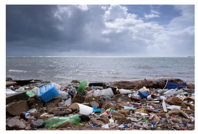
Marine litter on a coastal beach

FORENSIC SCIENCE MEETS ARTIFICIAL INTELLIGENCE TO HELP IN THE BATTLE AGAINST PLASTIC POLLUTION