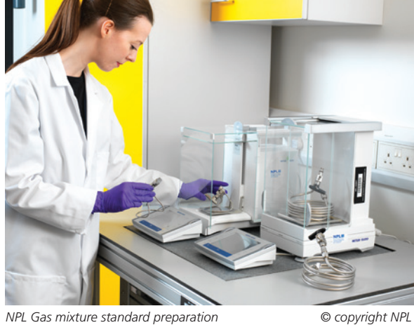
NPL Gas mixture standard preparation

oxygen to ensure that it will help to cure, not harm patients.