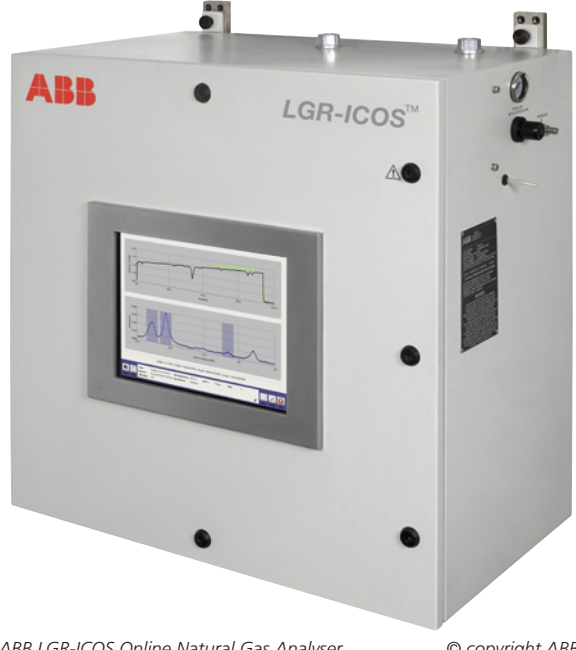
ABB LGR-ICOS Online Natural Gas Analyser

Internationally acclaimed metrological bodies, such as NPL, play a role beyond defining the composition of gas standards for new applications. They also produce high precision gas standard mixture cylinders that contain the required chemical species at the relevant concentrations. These certified gas mixtures can be used to calibrate gas analysers in the field which are in service to measure the CO<sub>2</sub> purity.