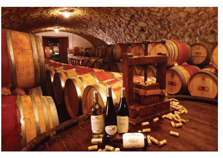
Fig. 7: Wine cellar