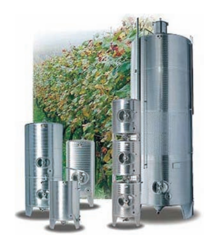
Fig 1: Modern wine production in stainless steel tanks

For more than 2,000 years, winegrowers have been trying to keep the oxygen content of their wines as stable and as low as possible. Undesirable oxidation processes, which can strongly impair the quality of the wine, should be avoided. The oxygen concentration in wine is therefore measured at a number of stages (production, storage, filling). The new digital LDO technology makes this determination simpler and more reliable than ever before. The HACH LANGE LDO sensor can measure the oxygen content quickly and simply anywhere.