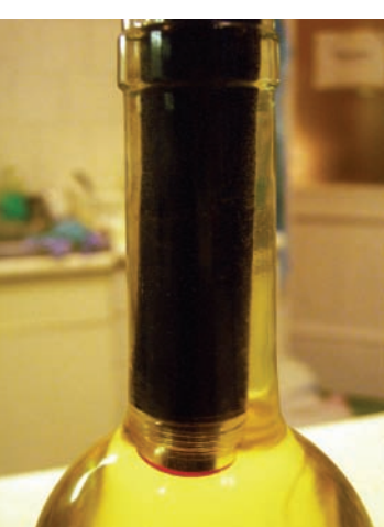
Figs. 3 and 4: Oxygen measurement in a bottle with HQD and LDO sensor