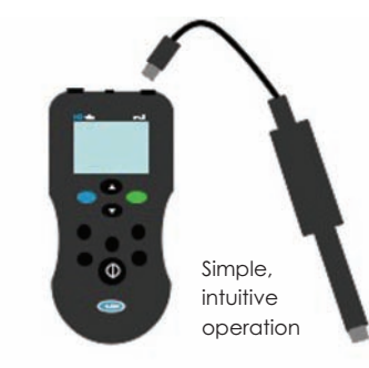
Automatic storage of measured values, including sample and user IDs

Simple data transmission to printer or computer