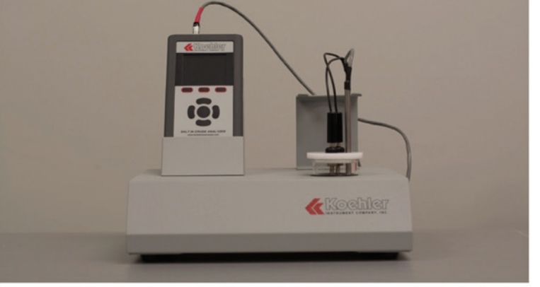
Figure 2: Koehler K23060 Salt in Crude Analyzer [11]

The large concentration of salt in crude oil can contribute to the mechanical clogging of furnace tubes, condensers, and lines by deposition, the corrosion of equipment by the hydrolysis of salts producing hydrogen chloride, and high ash content of still residues throughout the refinery process [7]. Predetermining the salt content in crude oil before the refinery process is an important quick and easy analytical method that can avoid machine failure and high repair cost. Excessive chloride left in the crude oil frequently results in higher corrosion rates in refining units, which can be seen in Figure 1, and has detrimental effects on the catalyst