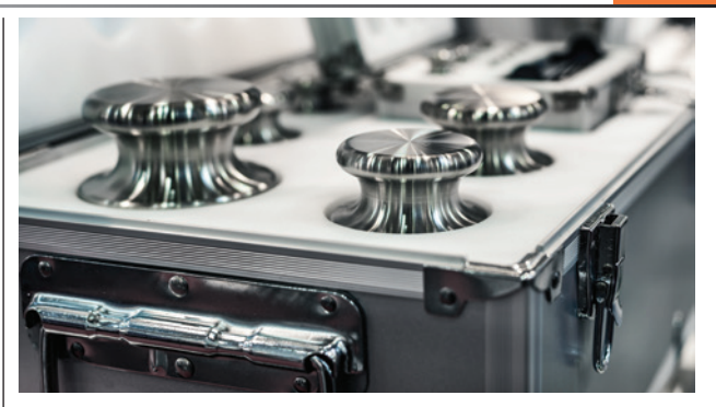
Kilogram and other standard masses