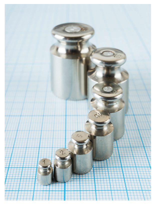
Kilgram and other masses