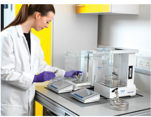
Preparing Siloxane gas mixtures - NPL

further challenges in the field of calibration mixture preparation and I am confided that NPL will continue to be at the forefront of developing reliable metrological reference materials to meet the needs of the energy transition that is taking place internationally".