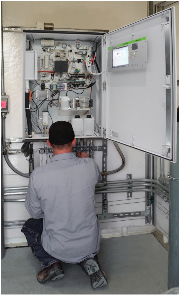
Chroma THC analyzer in odor control unit

Finally, a liquid sampling module can be included for total VOCs in water or other liquid sample in such as Liquid Propane Gas (LPG), Liquified Natural Gas (LNG), crude oil, diesel, fuel, oil or condensates without any human intervention for preparation. It consists of a simplified enhanced sampling system designed to extract representative samples from the liquid phase. The extracted liquid sample is then vaporized and injected