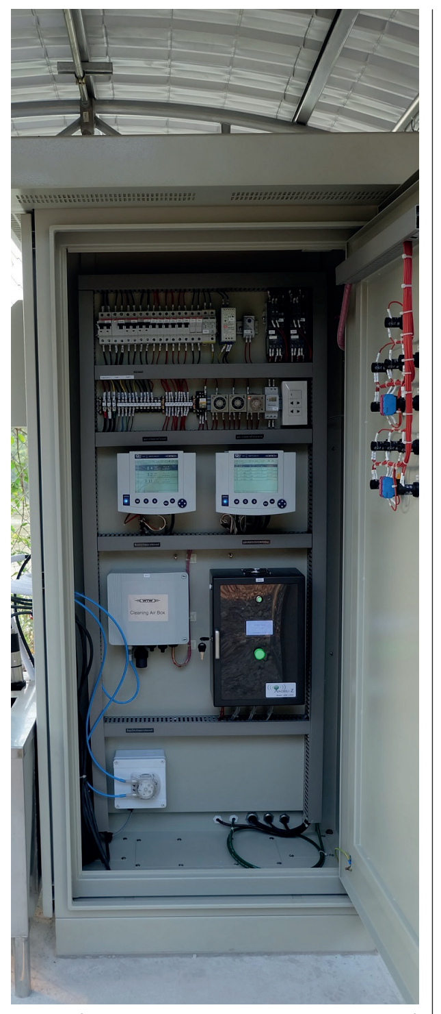
The inside of the measuring station with IQ controllers, a cleaning air box for the additional cleaning of the spectral sensor by means of compressed air as well as a modem for remote data transfer. To the left is the flow-through basin with installed oxygen, pH, conductivity and turbidity sensors.