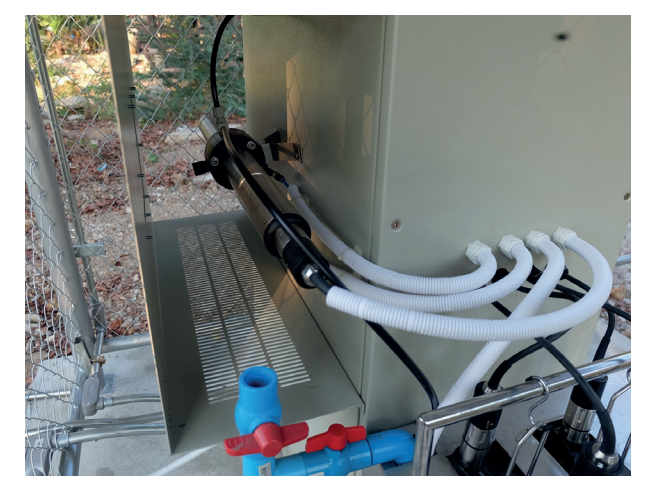
A spectral sensor with flow-through fitting, as well as additional compressed air cleaning, installed at the back of the measuring station.