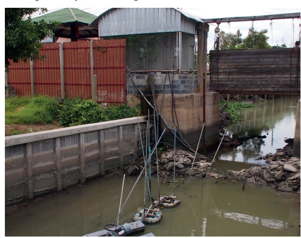
Khlong, where NiCaVis® 705 IQ tests for COD and nitrate were conducted by means of the spectral sensor. Discharged/inlet by a wastewater treatment plant in an industrial park in immediate vicinity.