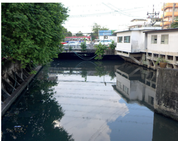
A Khlong in the city center of Bangkok.