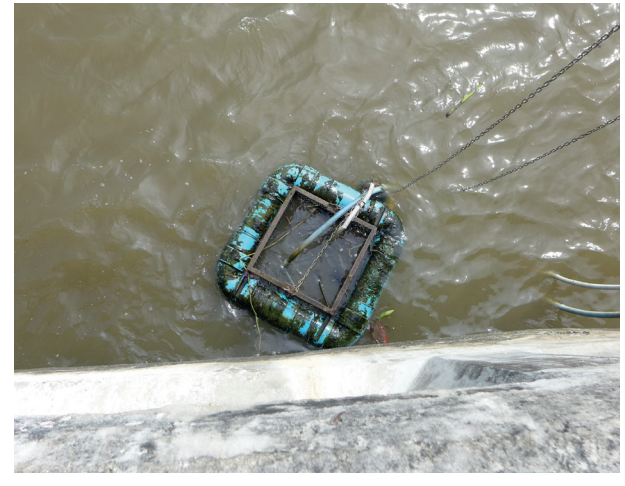
Water sampling site of a measuring station. The water is sampled by means of a submersion pump which is protected from debris and quick occlusion by a rough underwater metal cage. The sampling site is equipped with a floater to allow water sampling during severely fluctuating water levels.