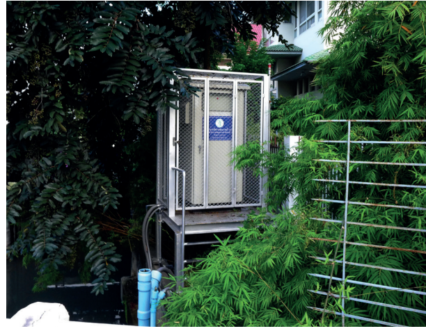
A measuring station at a Khlong in the city center.

+200 state-owned river water measuring stations for the measurement of water quality in the metropolitan area of Bangkok with measuring devices manufactured by WTW brand. The measured standard para-meters are oxygen, turbidity, pH value and conductivity. Another 16 measuring stations were added which measure the additional chemical (COD) and the biochemical oxygen demand (BOD) as parameters for the organic load, as well as nitrate by means of spectral sensors (NiCaVis® 705 IQ).