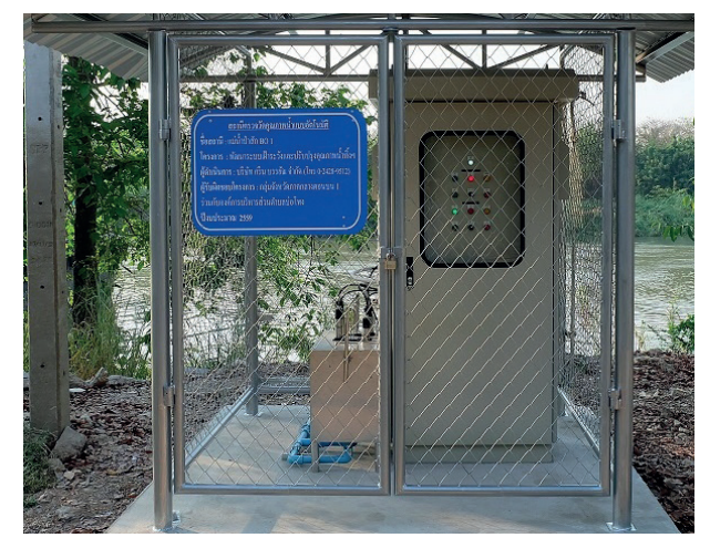
One of the 16 newly installed river water measuring stations in the metropolitan area of Bangkok. It is fitted with a housing to prevent vandalism and theft of measuring devices.