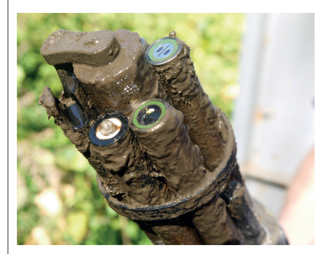
Effective anti-fouling using wiper

The best sensors with poor installation or maintenance will provide bad data. A robust maintenance program is required to ensure the best possible data. This is typically monthly or bi-monthly.