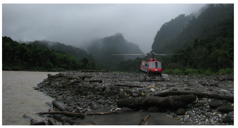
An example remote monitoring site only accessible by helicopter

Power is not an issue for the AquaStation thanks to the 12V, 115Ah battery that's installed in the unit; in addition, the battery is kept topped up using solar or wind power meaning you should never have to charge the battery.