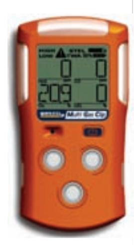
Diagram 5: Gas Clip Technologies' Multi Gas Clip

With more workers requiring confined space entry than ever before, safety during these industrial operations is critical. Using the latest, most advanced technology to overcome the limitations of older sensor designs ensures the safest conditions for workers, residents in the surrounding areas, and the environment. For combustible gas measurement, photodiode-driven infrared sensors are the next generation of safety.