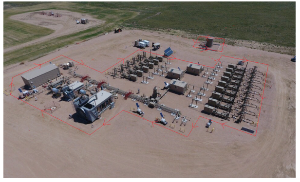
Separators at Noble Energy's Wells Ranch, Colorado site are located so close together that engineers need an intrinsically safe infrared camera to execute their sand measurement preventative maintenance program.

Meanwhile, the monitoring program has already paid major dividends by identifying 300 tanks in less than a year with sand piles high enough to endanger their fragile fire tubes. There's no way to know if all 300 of those tanks would have failed without being cleaned out. Even if monitoring with the GFx320 prevented only one failure, then it saved the $100,000