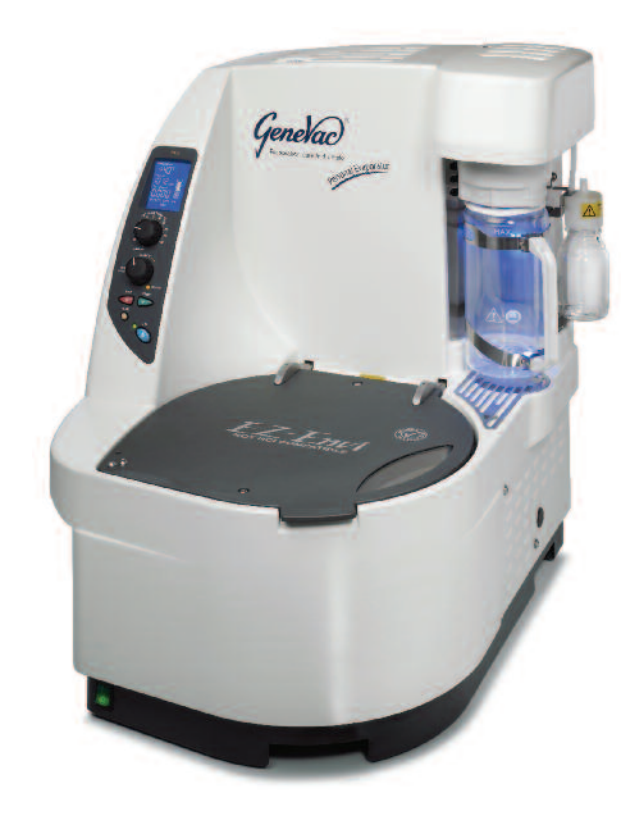
Figure 1 – Genevac EZ-2 Envi

A standard solution containing the US-EPA 16 PAHs (as defined by IARC, 1987) was spiked onto quartz fibre filters or XAD2 resin tubes and allowed to air dry. The filters / tubes were then extracted twice using 7ml DCM and sonnication in the ultrasonic bath for 15 minutes at room temperature. The combined sample (14ml) had a 100µl aliquot removed. This was made up to 1ml with acetonitrile was taken and injected into HPLC-Fluorescence to provide a 100% reference. The remaining DCM had 100µl 2-pentanol added as a solvent keep and was evaporated via centrifugal vacuum evaporation in the Genevac EZ-2 Envi (Figure 1). Temperature and pressure during evaporation were controlled such that the DCM evaporates but the 2-pentanol does not, as previously