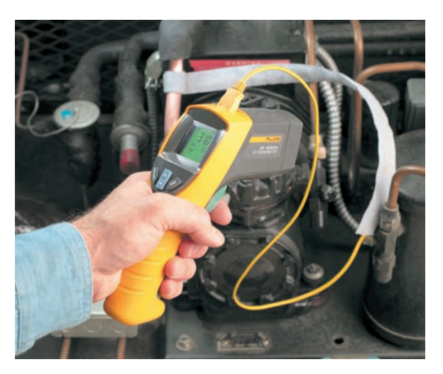
Fig. 4: The Fluke 561 multipurpose thermometer combines a contact and non-contact (infrared) thermometer into one portable tool.

For starters, understanding the optical resolution and emissivity ratings of your IR thermometer and the target you plan to measure will help you avoid inaccurate measurements.