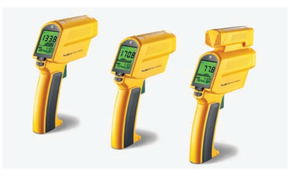
Fig 5: Fluke 570 Series IR thermometers provide highperformance capability for more accurate and professional temperature measurements.

Other considerations to make before you invest in an infrared thermometer include temperature range, response time, information display capability, and whether you require data logging and professional documentation. For example, the wider the temperature range, the more applications you can use the tool for, especially in the area of process monitoring. Quicker response times down to 250 mSec, which are inherent in high-end thermometers, ensure accurate readings, especially when target temperature is changing rapidly. In addition, the more information made available to you in the display, such as MIN/MAV/AVG temperatures plus visual alarms if temperatures exceed user-defined levels, the quicker you will be able to diagnose problems. Lastly, most premium units also enable you to log data collected on inspection routes and download it later to a PC for trend analysis and reporting. Quite uniquely, the Fluke 576 IR thermometer, for example, even documents temperature measurements with digital images showing the measurement target, and are stamped with the location name, time, date and target temperature. The