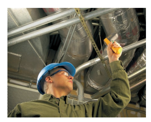
Fig 1: Non-contact infrared thermometers offer a fast, safe and accurate method of measuring surface temperature.

Full-featured tools may carry a higher price tag, but in many cases they offer the most flexibility and are often the best way to measure temperature quickly, safely and accurately in a broader range of industrial applications.