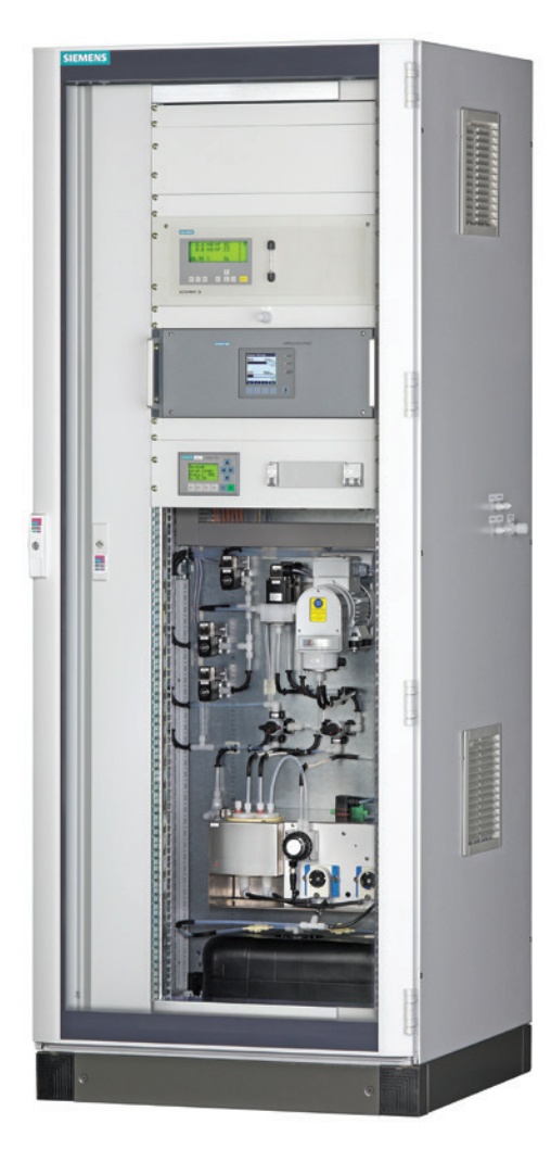
Set CEM CERT – a new modular certified system from Siemens