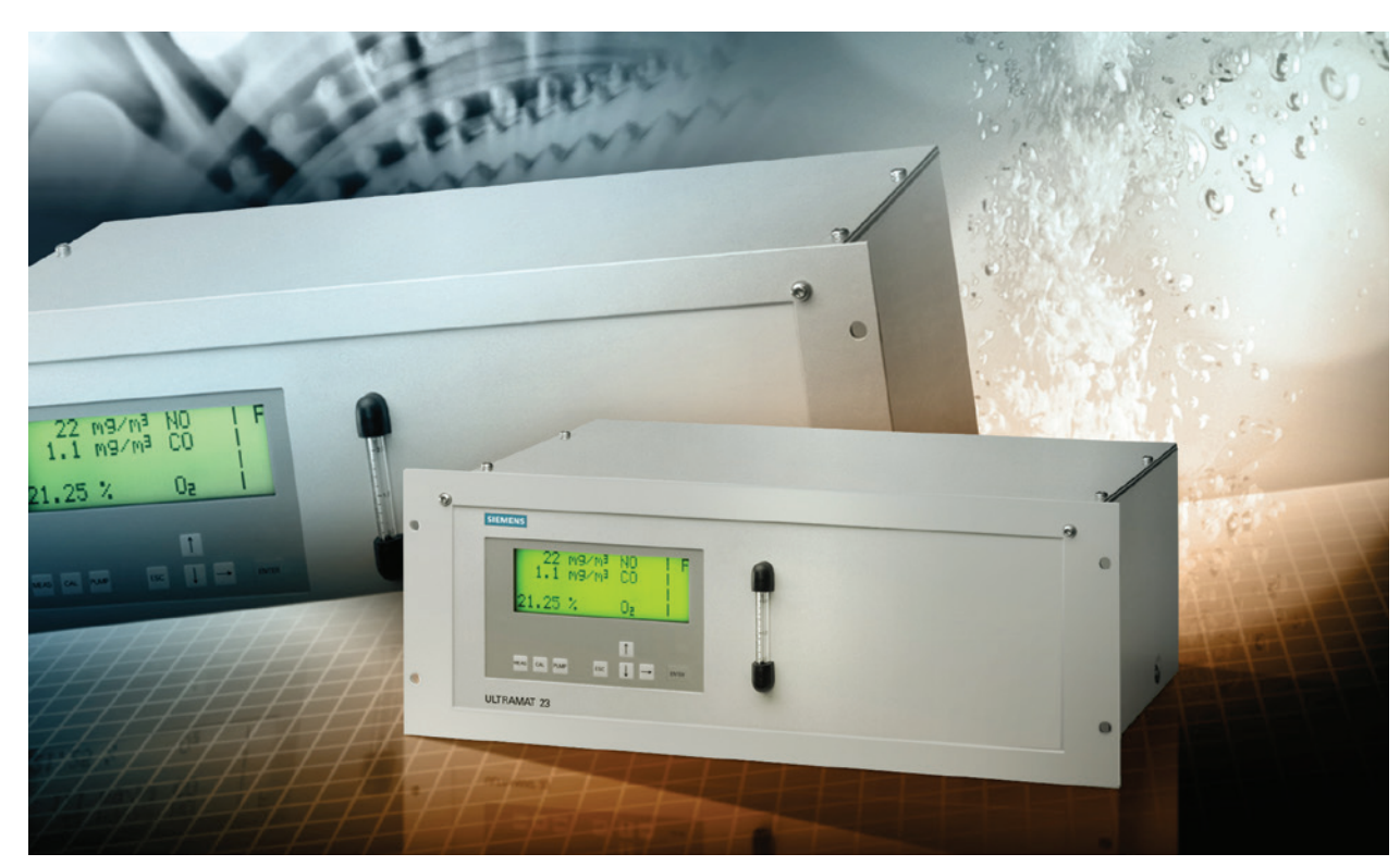
ULTRAMAT 23 multi component NDIR analyzer

Many industrial process operators have to continuously monitor the emissions from their chimney stacks. The Industrial Emissions Directive (IED) 2010/75/EC provides in Europe the legal framework for the plant permit conditions including emission limit values (ELVs), which must be based on the Best Available Techniques (BAT).