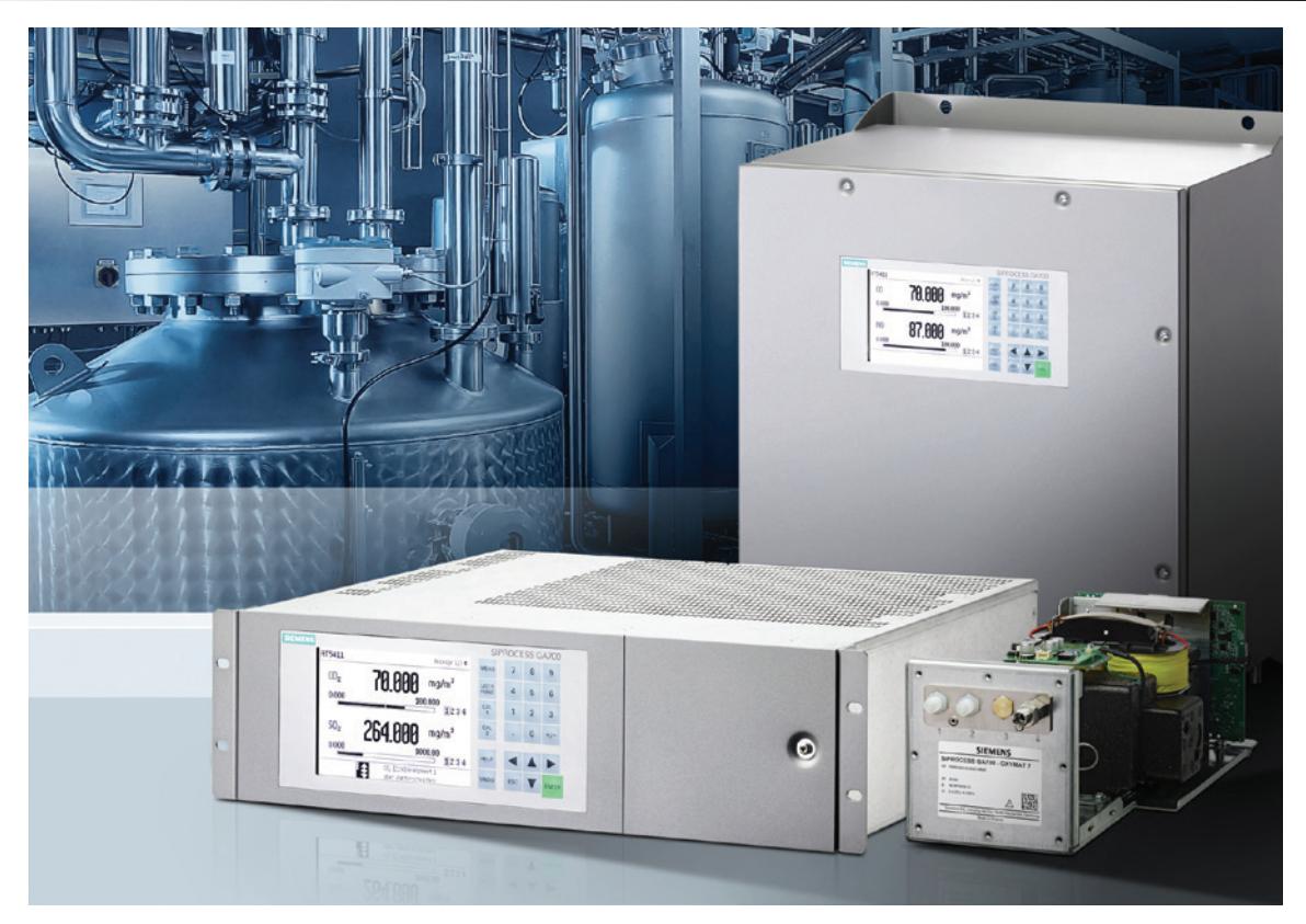
Siemens SIPROCESS UV600 NDUV analyzer

The nitrogen oxides emission limit values (ELVs) for gas fired power plants at a limit of 35 mg/m3 are at a low level. With Set CEM CERT such low ELVs can be realized, when choosing the SIPROCESS UV600 NDUV analyzer (non dispersive ultra-violet). The UV measurement